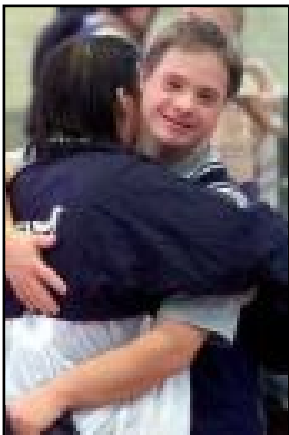
Athletes celebrate their accomplishments.

Tax-deductible donations can be made online and donors can designate funds to be used in the region where they reside or the unspecified donations will be divided equally among the regions.